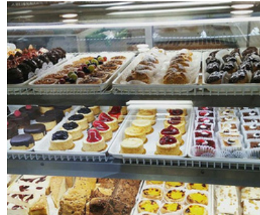
Chocolate & Pretzels