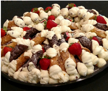
add chocolates Sp